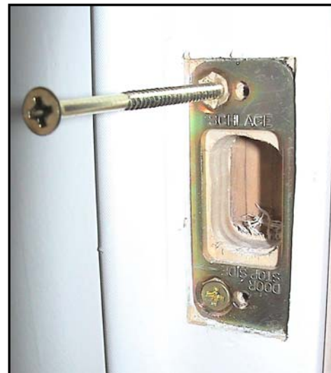
2-Screw Security Strike Plate (3-inch screw shown)

Please call the Crime Prevention Unit at 425-257-7521 if you would like more information about the Crime Free Rental Housing Program.