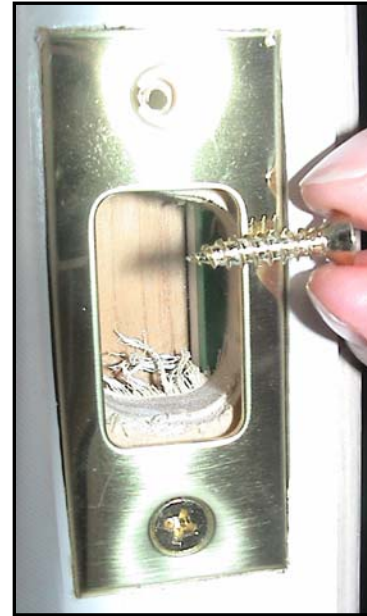
Typical Dead Bolt Strike Plate (1/2 inch screw shown)