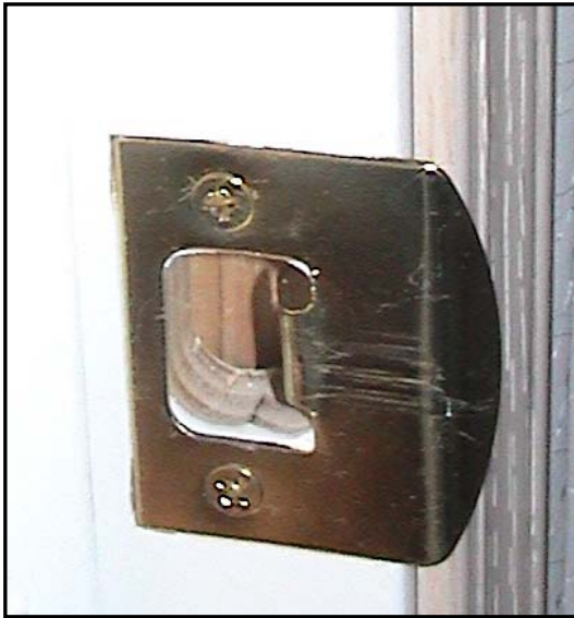
Typical Single Cylinder Door Knob Strike Plate